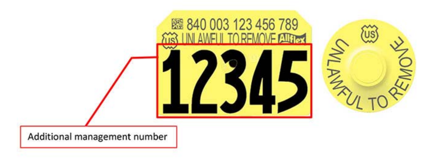
Example 3: 840 ear tag with premises ID number printed on bottom. Another option is to have your premises ID printed on the blank section of the tag.