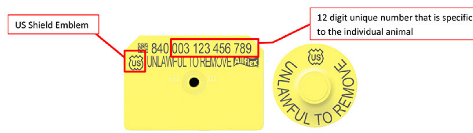
Example 2: 840 ear tag with management number printed on bottom. In this case, the tag purchaser chose to add additional numbers to the blank section of the tag at the bottom for management purposes.

Example 1: 840 rectangular ear tag without any management number or premises ID printed on bottom. This is the standard 840 ear tag layout. This would be an acceptable form of ID since each tag still possesses a unique 12 digit number for each animal.