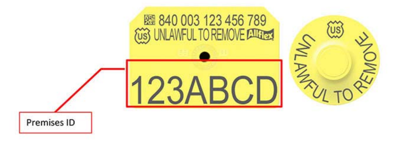
Example 4: 840 round button ear tag